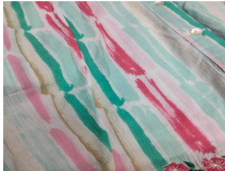
OPTION - 5