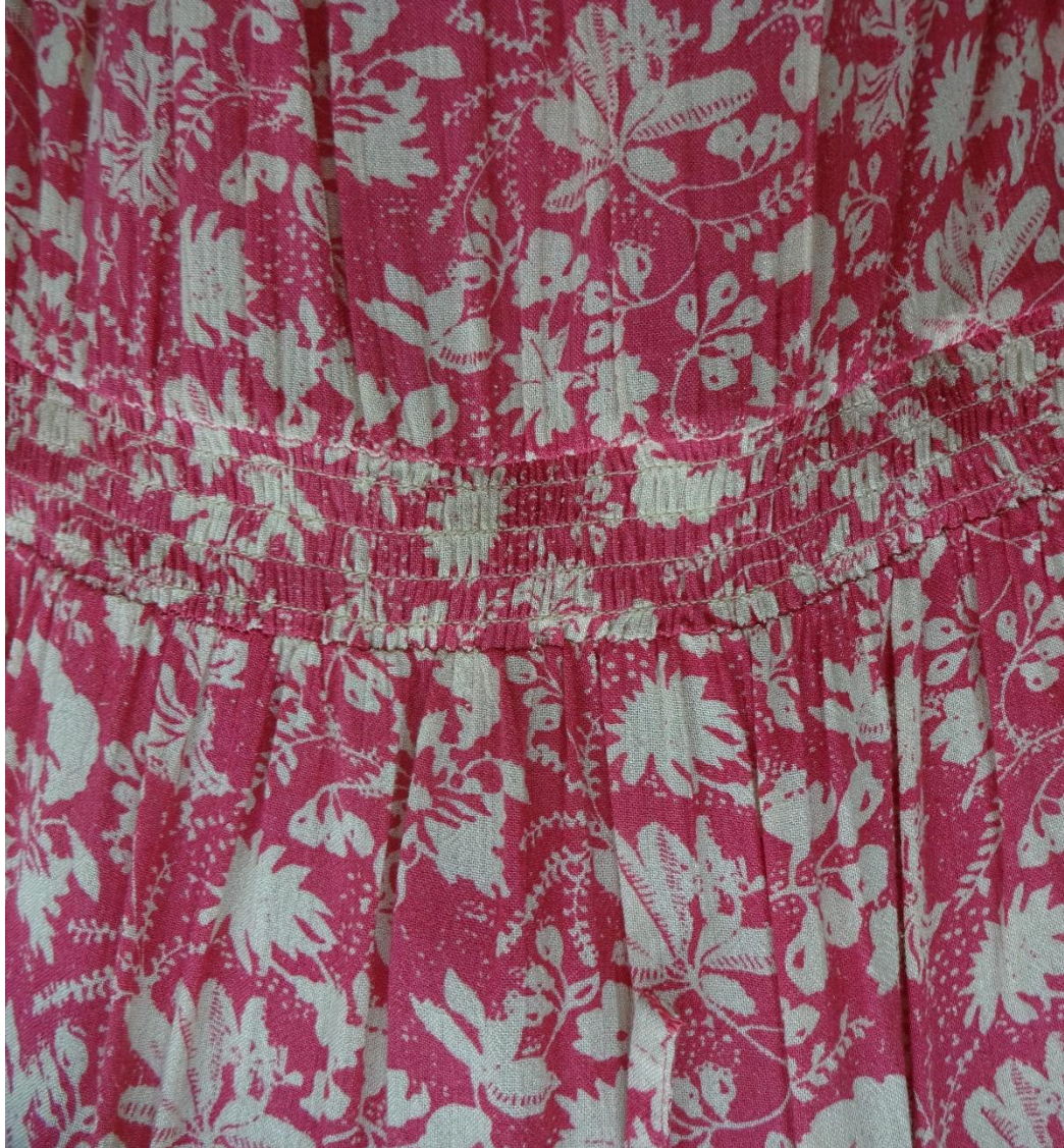
OPTION - 1