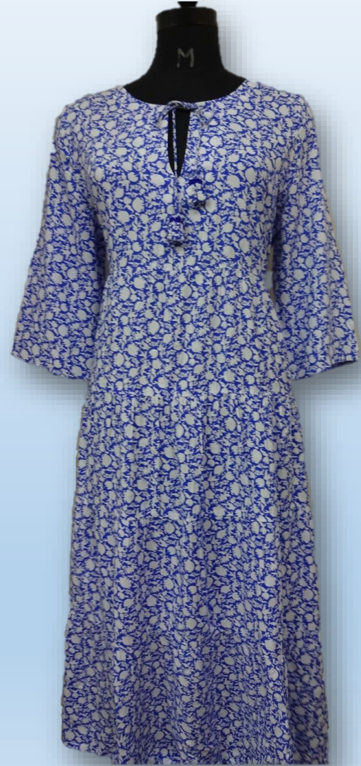
VISCOSE GGT DRESS