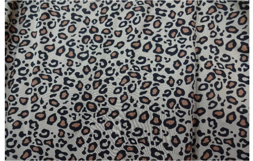
OPTION - 3