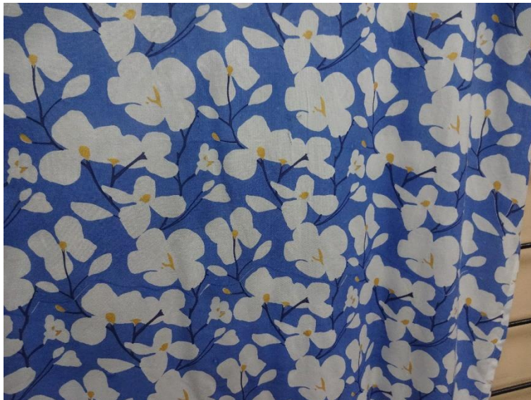
OPTION - 4