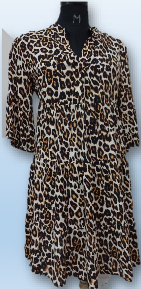
VISCOSE MOSS DRESS