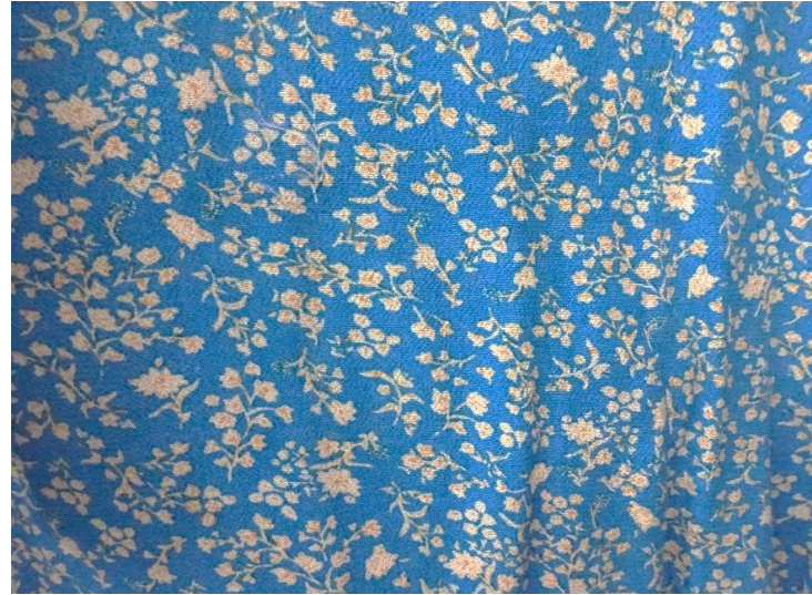
OPTION - 2